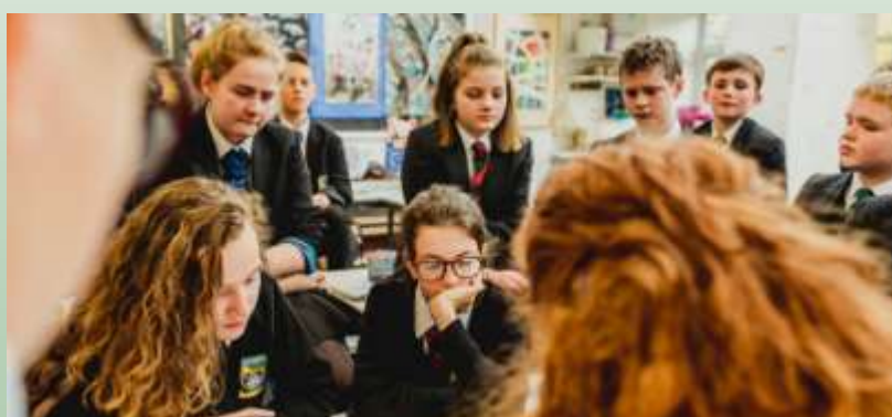
Teacher of Business Studies