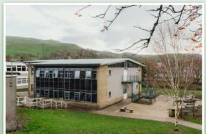
Teacher of Business Studies

We are keen to add a hardworking and friendly teacher to become part of the family that is Settle College and join our professional department to further enhance our successes for all students.