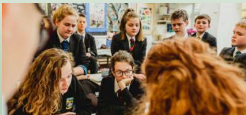
Teacher of Business Studies